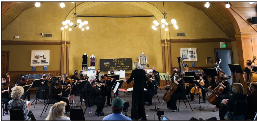
The DSO String Ensemble performs a socially distanced concert that was livestreamed to patrons.